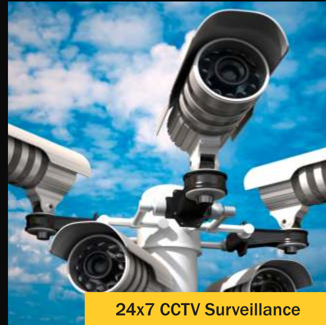
24x7 CCTV Surveillance