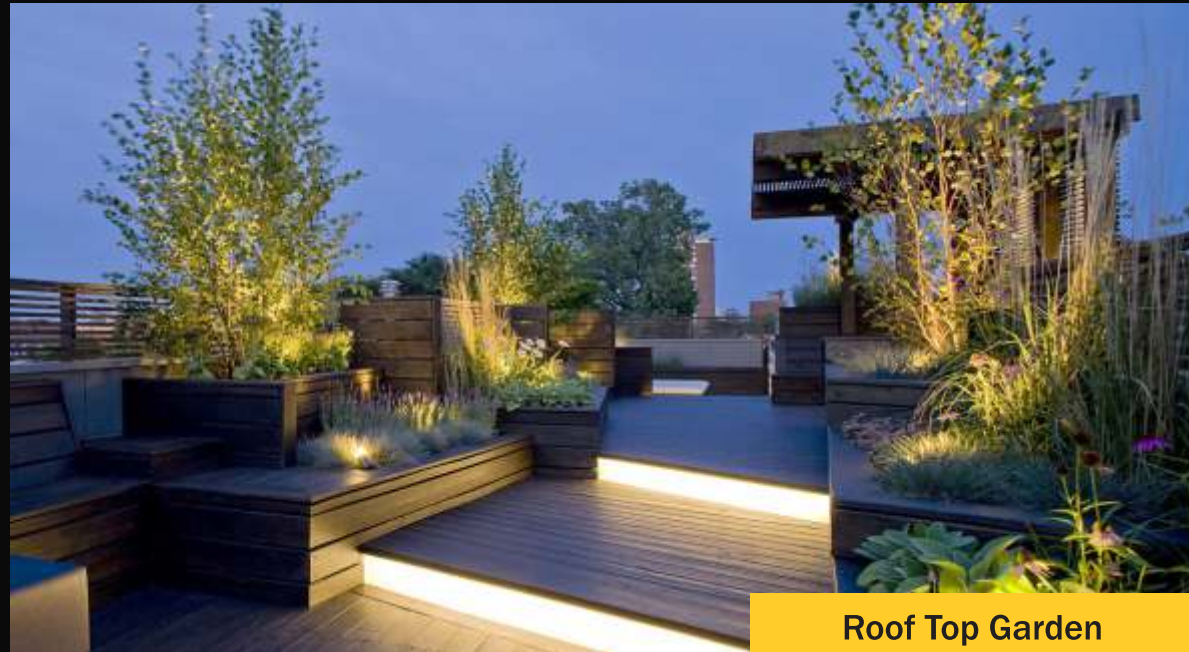
Roof Top Garden

...importance given to the minute entities !